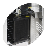
Easy access to clean dust filter