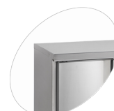
Available without splash back